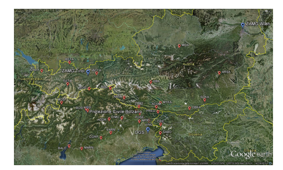
Figure 1. 2 SeismoSAT map with seismic stations in red and data centres in blue.

internet outage, showing the project capability of automatically switching to the backup satellite links. The SeismoSAT project was funded by the Interreg IV Italia-Austria (Interreg IV Italia-Austria, 2007) program based on the European Regional Development Fund (European Regional Development Fund, 2000).